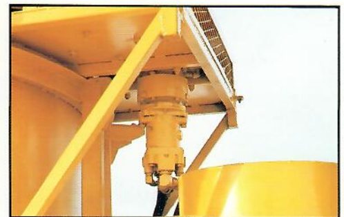
The tub is driven by Sundstrand planetary gear with a ratio of 22:1. The drive is smooth and steady. Jerking starts are eliminated.