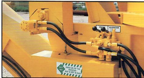
Hydraulic controls for elevating, lowering or folding the conveyor are located near the elevator for easy access.