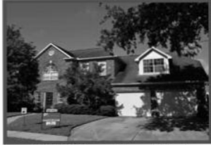
1107 Morning Mist

WOW!! Largest home (4,325) in Misty Lake!