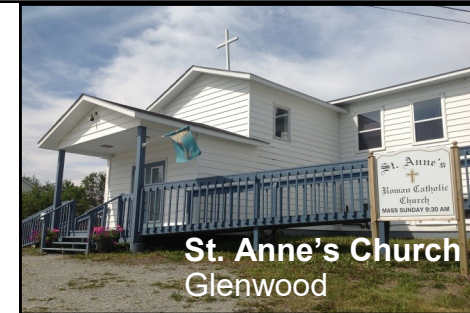
St. Anne's Church Glenwood

stjosephsparish@nf.aibn.com http://www.stjosephsparishgander.ca