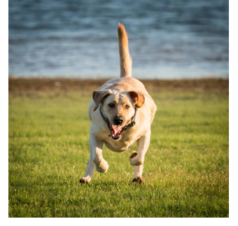
Kingsley Got Some Tailwind There Kushal Bose