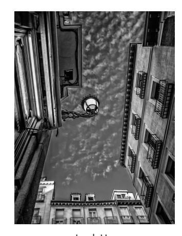
Look Up Bruce Lande