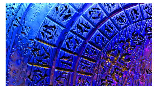
Transformers Spark at Paramont Carl Wood