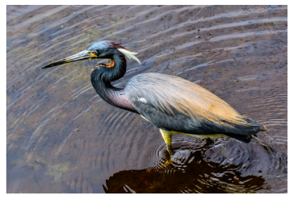
Tricolored Heron