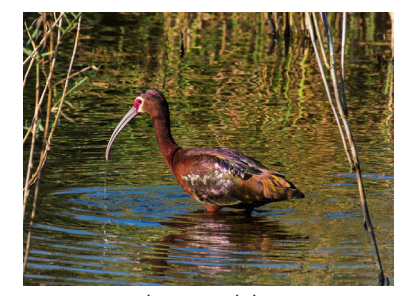
White Faced Ibis Stennis Shotts