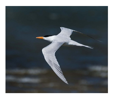
Royal Tern Stennis Shotts