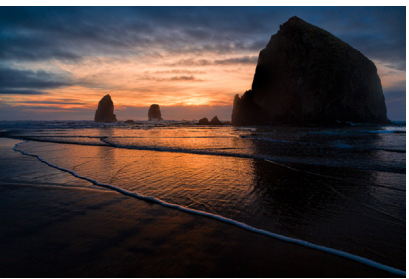
Sunset Tide Dan Tonissen