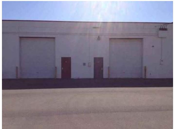
12267 Universal (11)