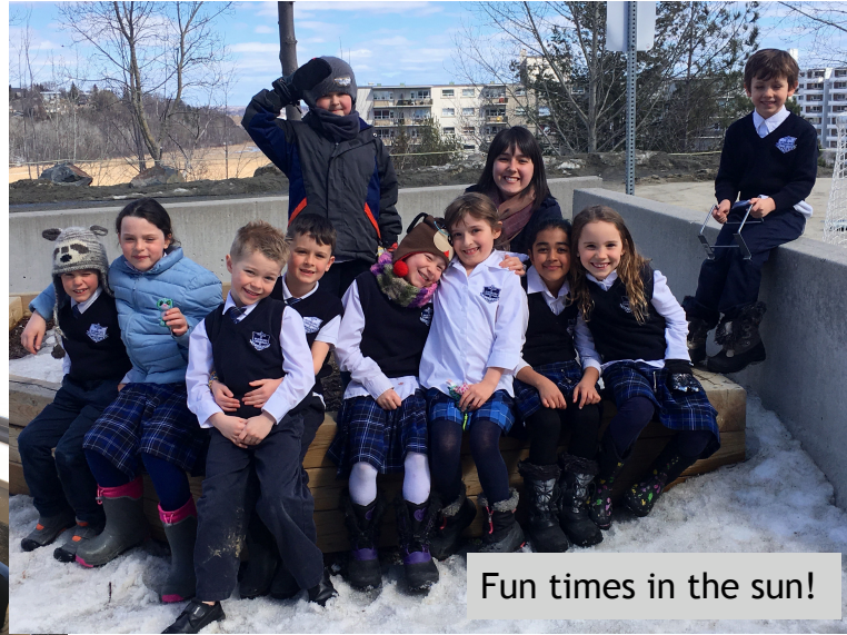
Fun times in the sun!