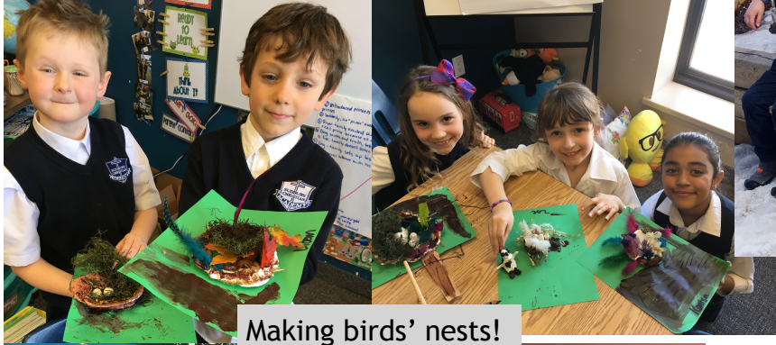
Making birds' nests!