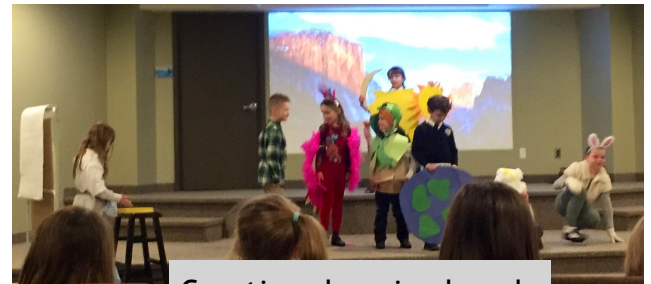
Creation show in chapel.