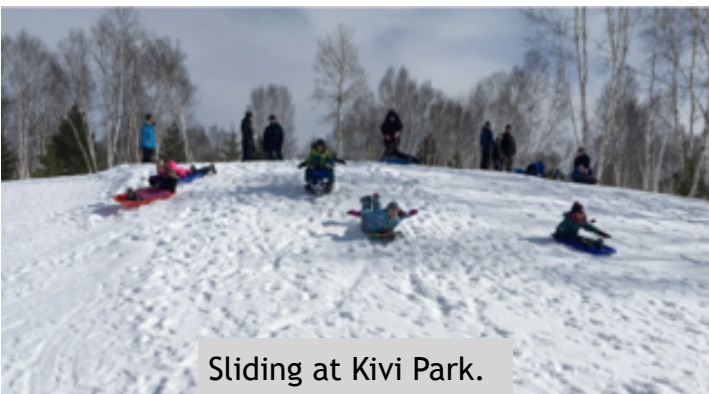
Sliding at Kivi Park.