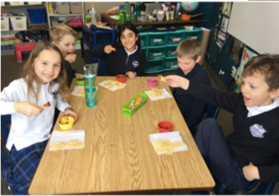
Testing out their homemade salsa!