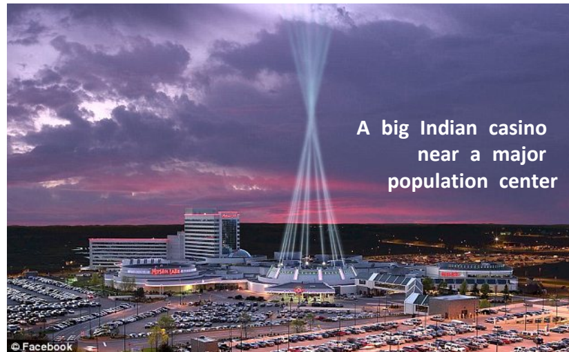
A big Indian casino near a major population center

widespread, big money opportunity for tribes that were lucky enough to be near cities and large population centers so, unsurprisingly, Harvard's research was focused heavily on Indian casinos as powerful new engines for Indian economic development.