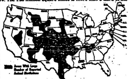
With Areas With Large Number of Reported Animal Mutilations

The Justice Department authorized the FBI office in Albu-