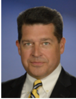
Mark Hatfield/ George Washington Marcus Garvey