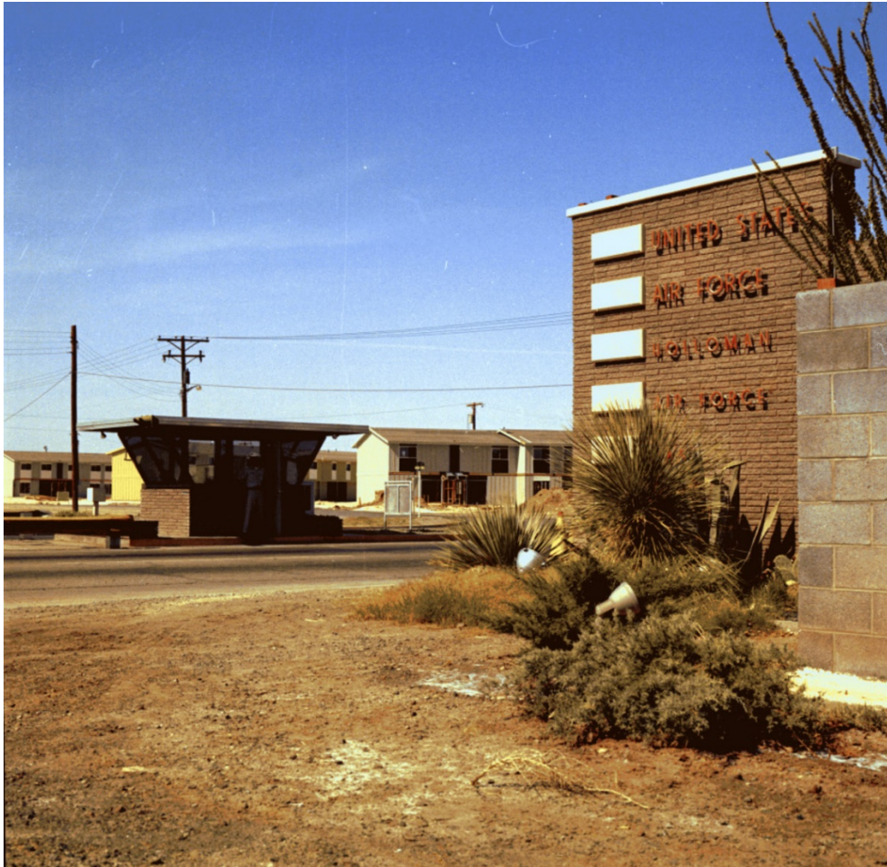
An undated photograph outside the Holloman Air Force Base in New Mexico, around where the incident occurred.