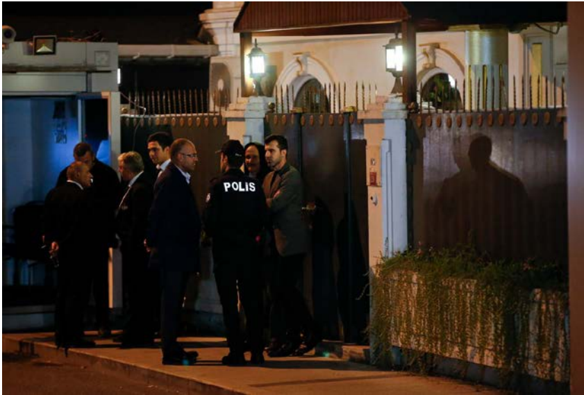
Turkish police officers and Saudi staff confer outside the consulate in Istanbul.