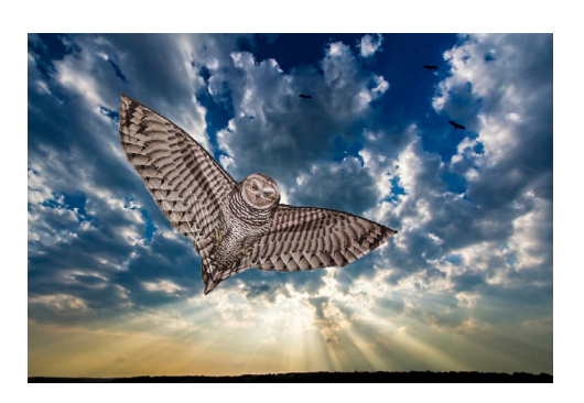
3rd Place Kushal Bose "It's Just A Kite"