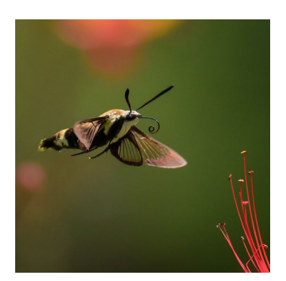
1st Place Linds Sheppard "Approach"