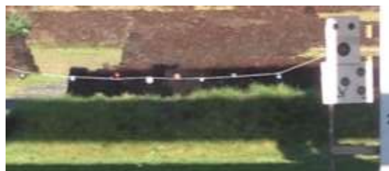
Mike Nesbitt hits the target

Did we make a difference for some kids this year? You bet we did. Between the donation and the raffle tickets we collected $1,476.00 (about $65 per person)! Add to that the $1,000 pledge from our very generous anonymous donor and the Muzzleloaders brought in a grand total of $2,476.00! A Marine gunnery sergeant from the Toys for Tots program came to pick up the money (and a few donated toys as well) after the match, which will be put to good use in the next few days to make a difference for several of our local families. Merry Christmas to all.