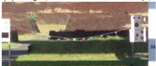
Christmas ornaments and paper targets

Jim Haeckel designed the course, combining two paper targets with some Christmas novelties. The paper targets, a fleur-de-lac and a six-bullseye, were both shot at 25 yards. The novelties were between 15 and 25 yards and consisted of some pine cones, charcoal, candy canes, water bottles, and a string of Christmas ornaments. Each paper target got 5 shots, for a total of 100 points, and one shot for each novelty item at 10 points each, for a grand total of 150 points.