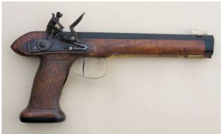
This is Don's "full-auto" flintlock pistol, one pull of the trigger and it just empties!