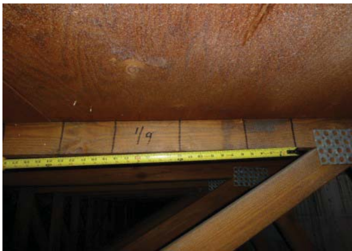
#3 ROOF DECK ATTACHMENT 6" X 6" NAIL SPACING