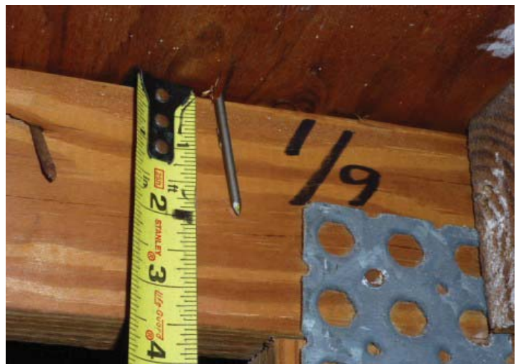
#3 ROOF DECK ATTACHMENT 8d NAILS