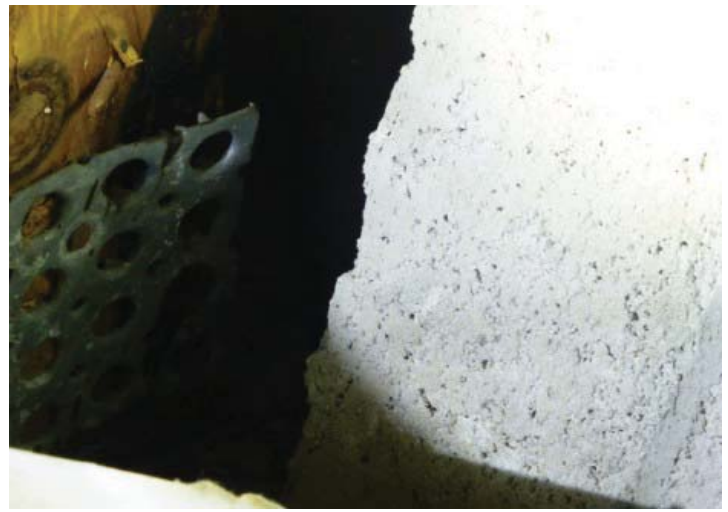
#4 ROOF TO WALL ATTACHMENT OPPOSITE SIDE