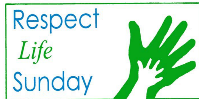
© J. S. Paluch Co., Inc.

An Invitation: Bishop Murry invites couples who are married civilly but not in the Church to inquire about beginning the validation process (“having your marriage recognized by the Church”).