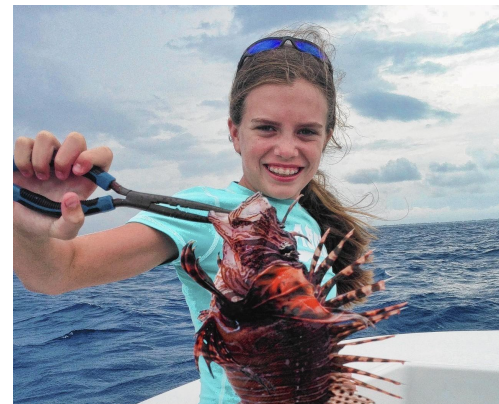
Palm Beach County girl credited for breakthrough in lionfish research