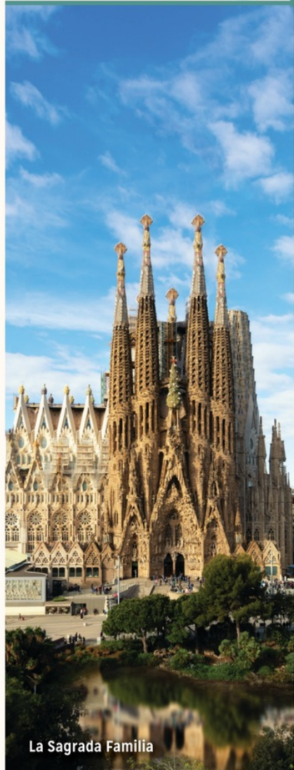
La Sagrada Familia

While its architecture and the lively pedestrian thoroughfare of Las Ramblas are some of the best-known things in the city, perhaps the actual best thing is the food.