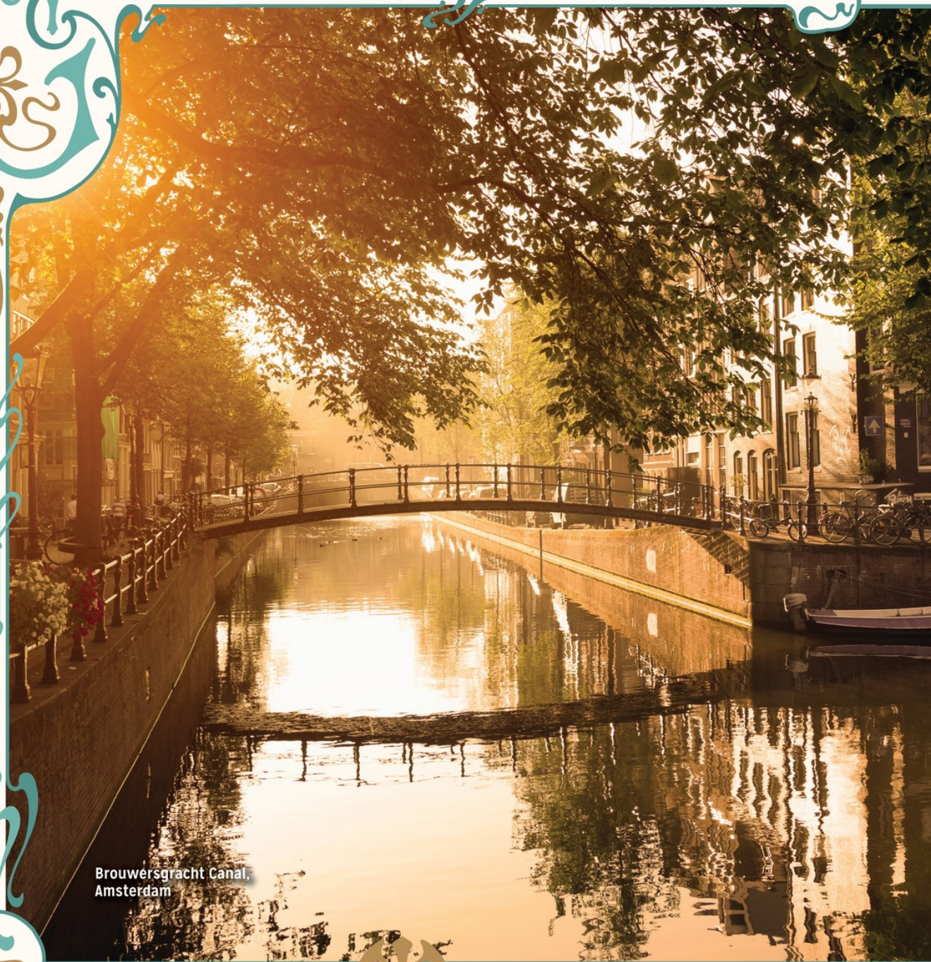
Brouwersgracht Canal, Amsterdam

Amsterdam, Barcelona, Lisbon and London are brimming with history and charm on a grand scale.