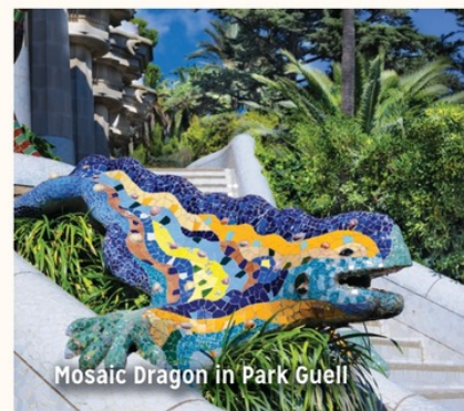
Mosaic Dragon in Park Guell

Unassuming courtyard restaurants serve up unforgettable fresh sangria with tapas like manchego cheese, chorizo and olives.