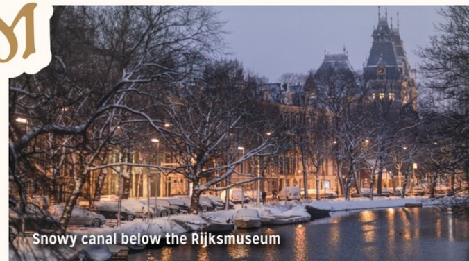
Snowy canal below the Rijksmuseum

From the flower-lined streets near the house, you can hear bells toll from Westerkerk, the largest church in Amsterdam. Its construction spanned from 1619 to 1631. Dutch painter Rembrandt, who lived nearby, was buried at the church.