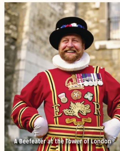
A Beefeater at the Tower of London

For a different perspective of the city, enjoy a leisurely cruise along the River Thames. The boat ride to Greenwich glides past some of London's most famous landmarks, such as the Houses of Parliament, St Paul's Cathedral, Tate