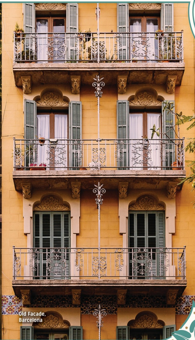
Old Facade, Barcelona

Amsterdam, Barcelona, Lisbon and London are brimming with history and charm on a grand scale.