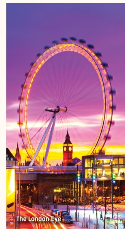
The London Eye