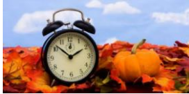
Sunday, November 2nd

Lane is a closed street and is not considered a residential street.