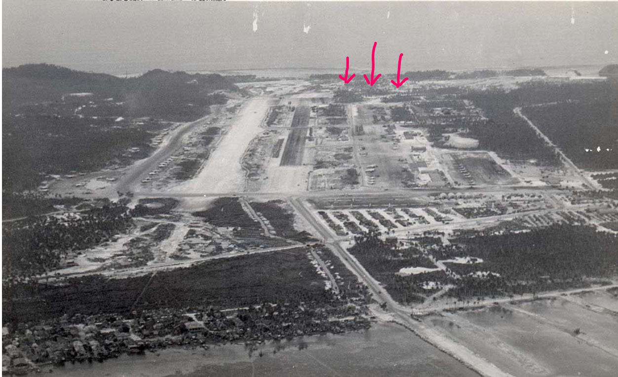
Figure B2: This World War Two archive image referenced previously in this report. The two hills and hole were worked around and resisted transformation even by the most powerful human force ever assembled.