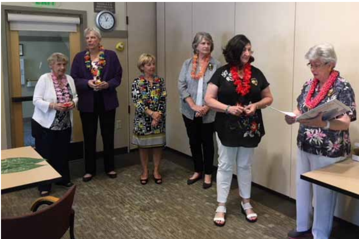
At Left: Secretaries, Treasurer's and President Elect being installed. Below: Directors being installed.