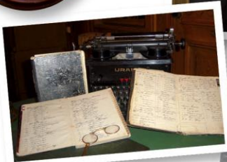
Original recipes from the 19th century

The Old Vienna Distillery is the only authentic historical Austrian Absinthe distillery since the 19th century. It has been run by the Fischer family for five generations.