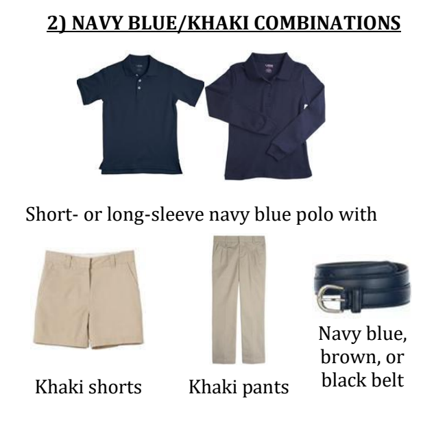
brown, or black belt