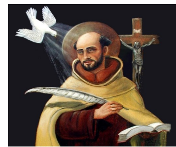
Feast Day: December 14