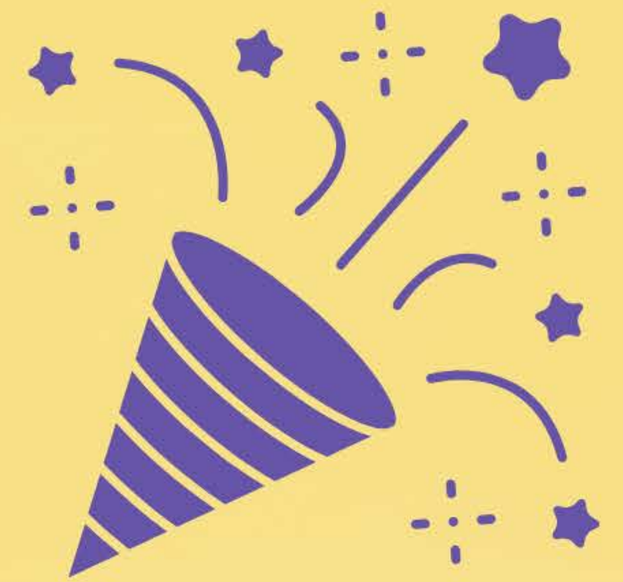
Members & friends join online!