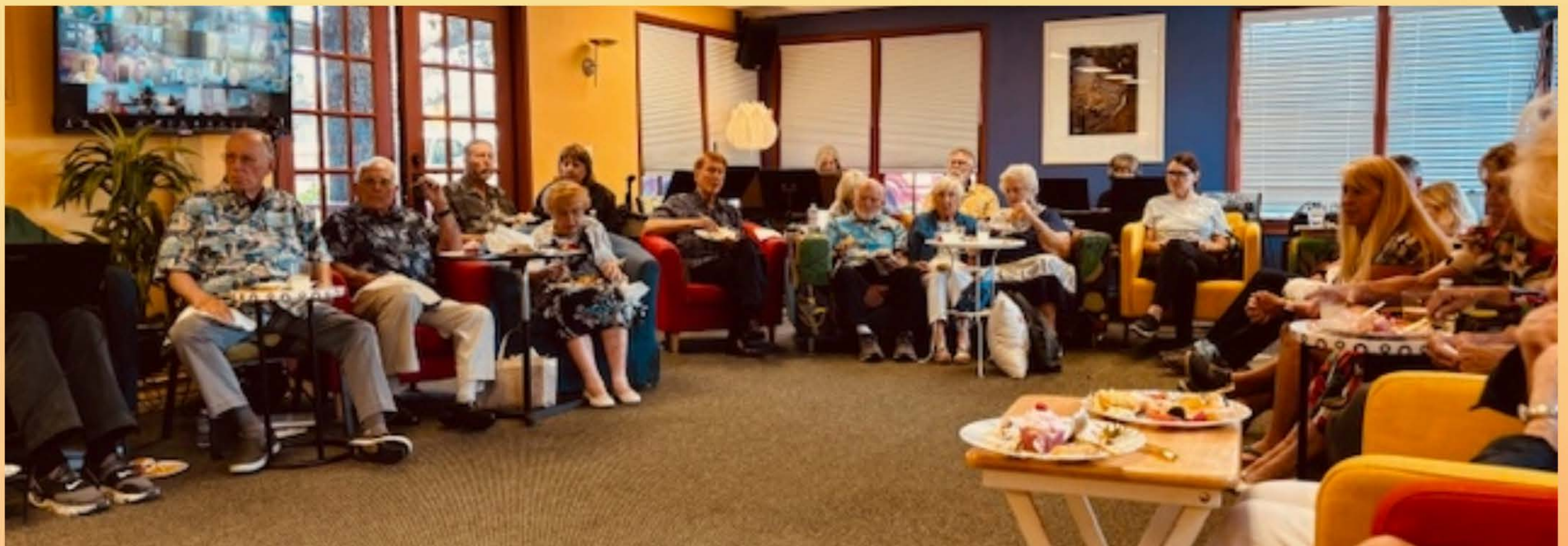
So many people contribute to bringing the Eblast to life every month! Heartfelt appreciation to each one of you!