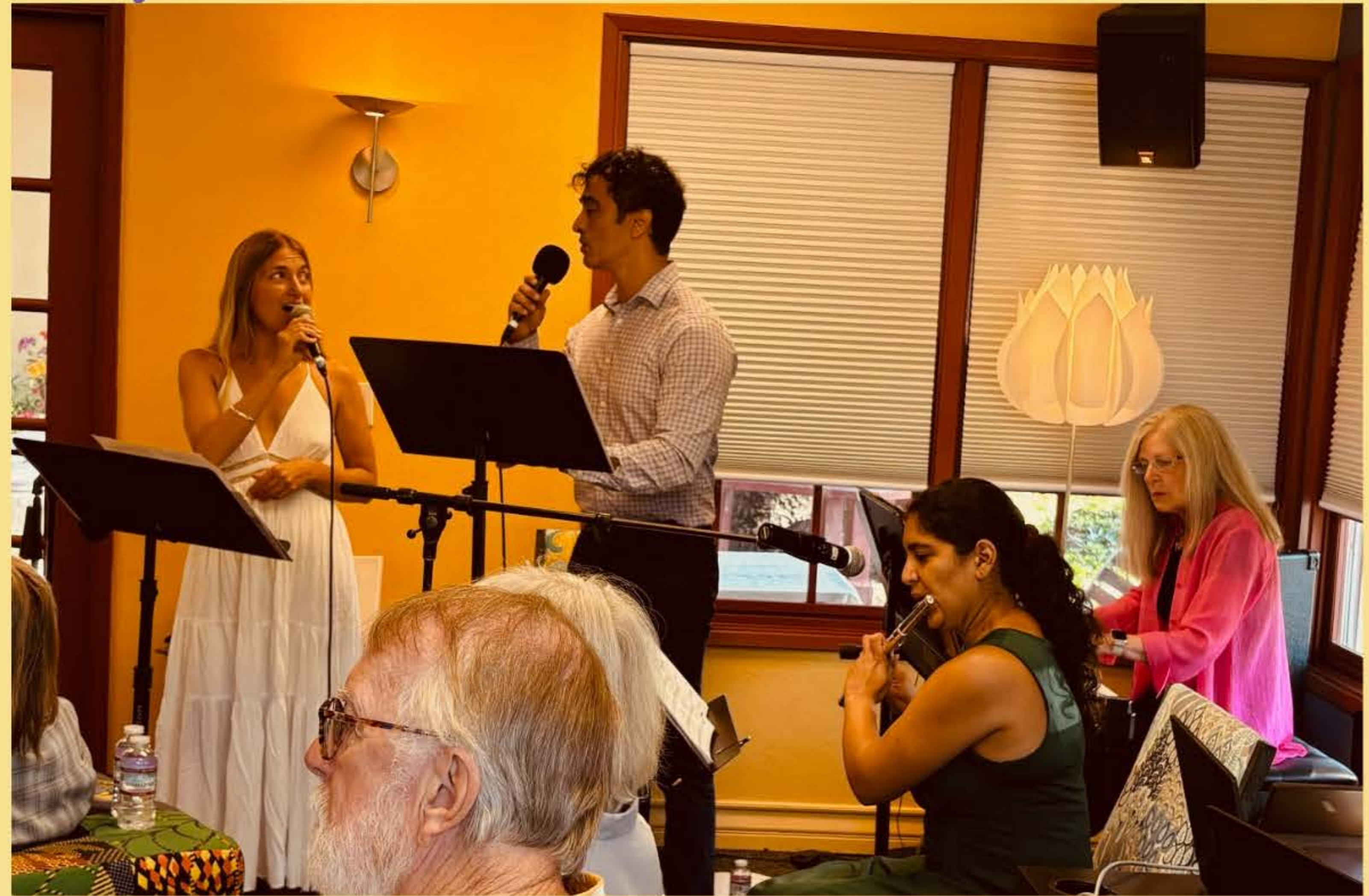
Amazing music from our incredible musicians!