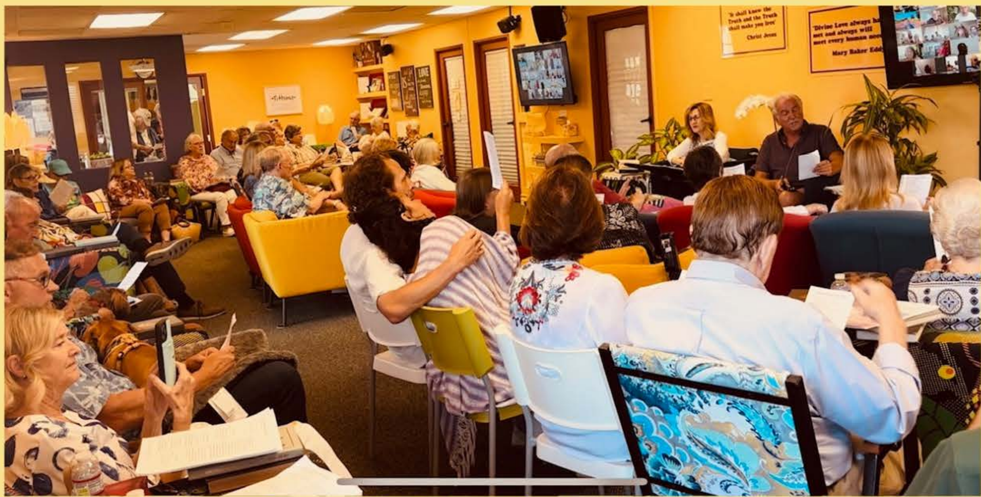
Members & friends join in the room!