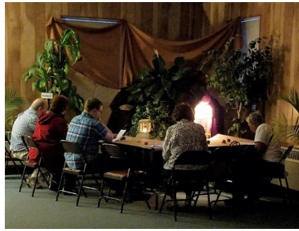
Our Good Friday Service in pictures....