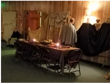
The Upper Room