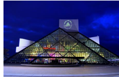
ROCK'N'ROLL REVIVAL XXX MARCH 7-10, 14-16

Become a Falcon Theatre Season Pass Subscriber and get V.I.P. status at all drama productions including "Mamma Mia!", Rock'n'Roll Revival XXX, One Act Play Night and Improv Nights. For $30 you get one ticket to these events, early admission to all the shows PLUS tickets for Rock'n'Roll Revival BEFORE they go on sale to the general public! WHAT A DEAL! Don't miss this amazing opportunity to see SPHS talent at it's very best! Information on specific shows and all SPHS drama events will be posted to our website: