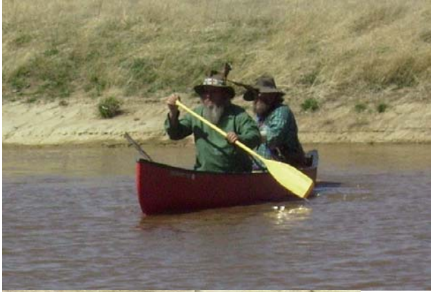
LZ and Tail Gunner