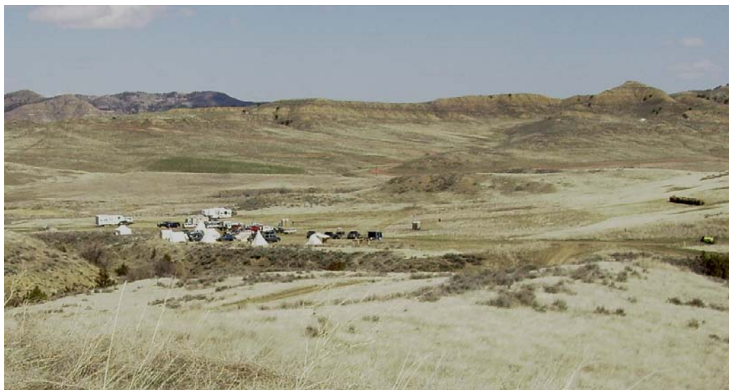
Ed Green Memorial Shoot Camp Site