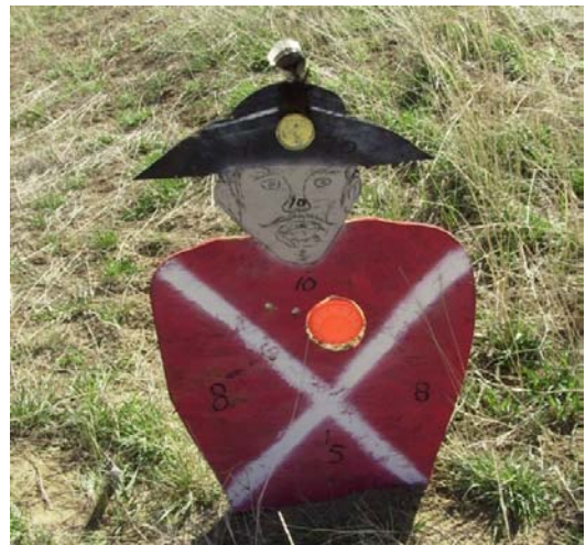
Get the Red Coat