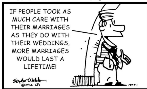
27th SUNDAY IN ORDINARY TIME