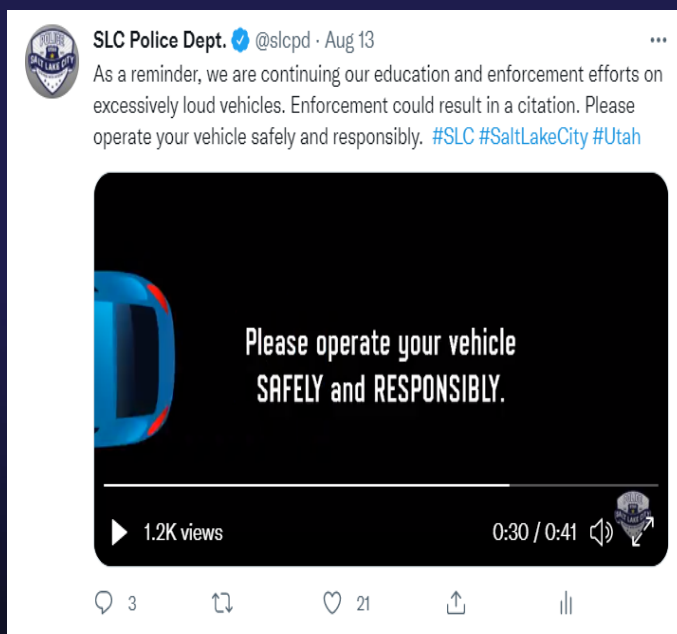
@SLCPD Twitter – Video graphic announcing education campaign