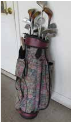
Ladies Golf Clubs Make an Offer. 352-212-7876