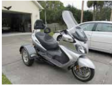
2005 Suzuki Burman Trike 11,700 Total Miles • Good Condition • Garage Kept $4,500.00 or Best Offer