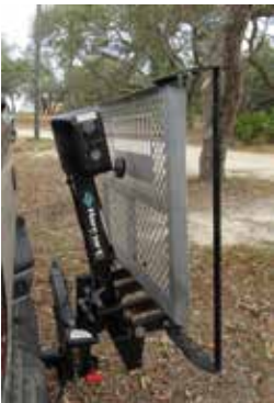
Harmar AL100 Mobility Scooter Outside Platform Lift $600.00 574-870-1597