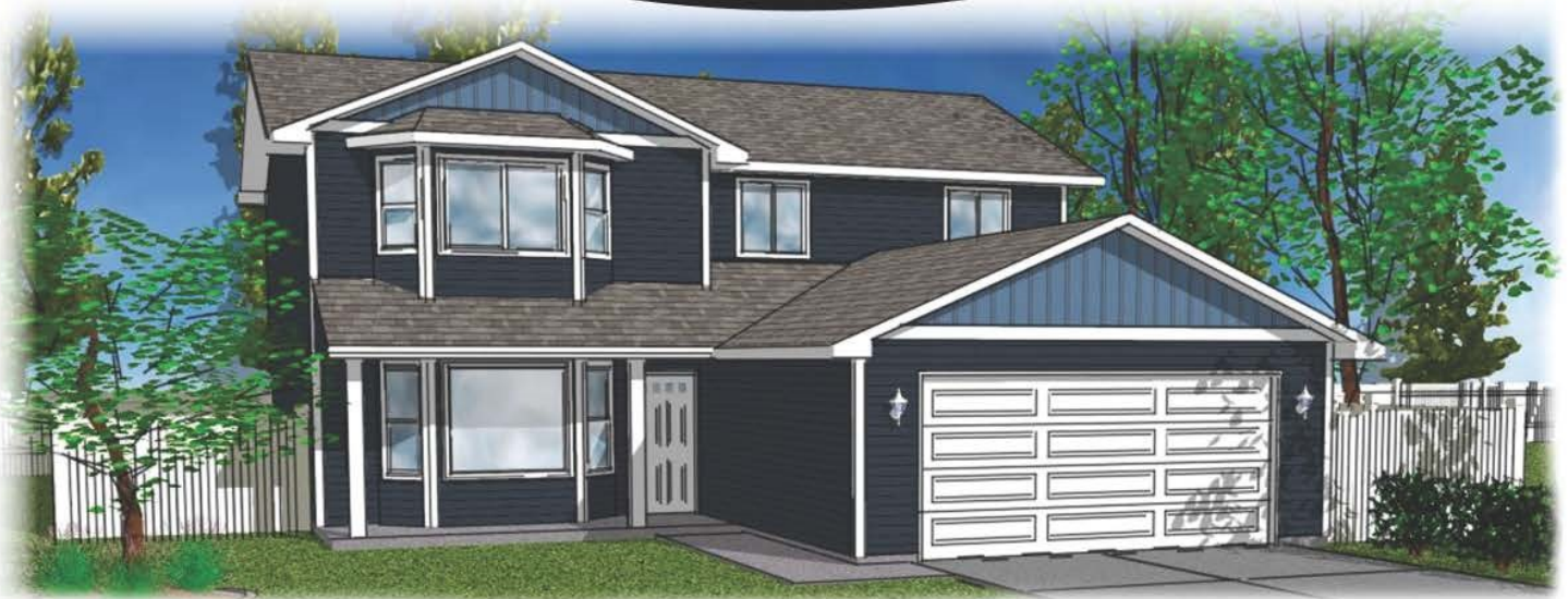
(Color combinations for brochure use only)

All measurements, dimensions and square footage are approximate and may vary. Prices may change without notice.