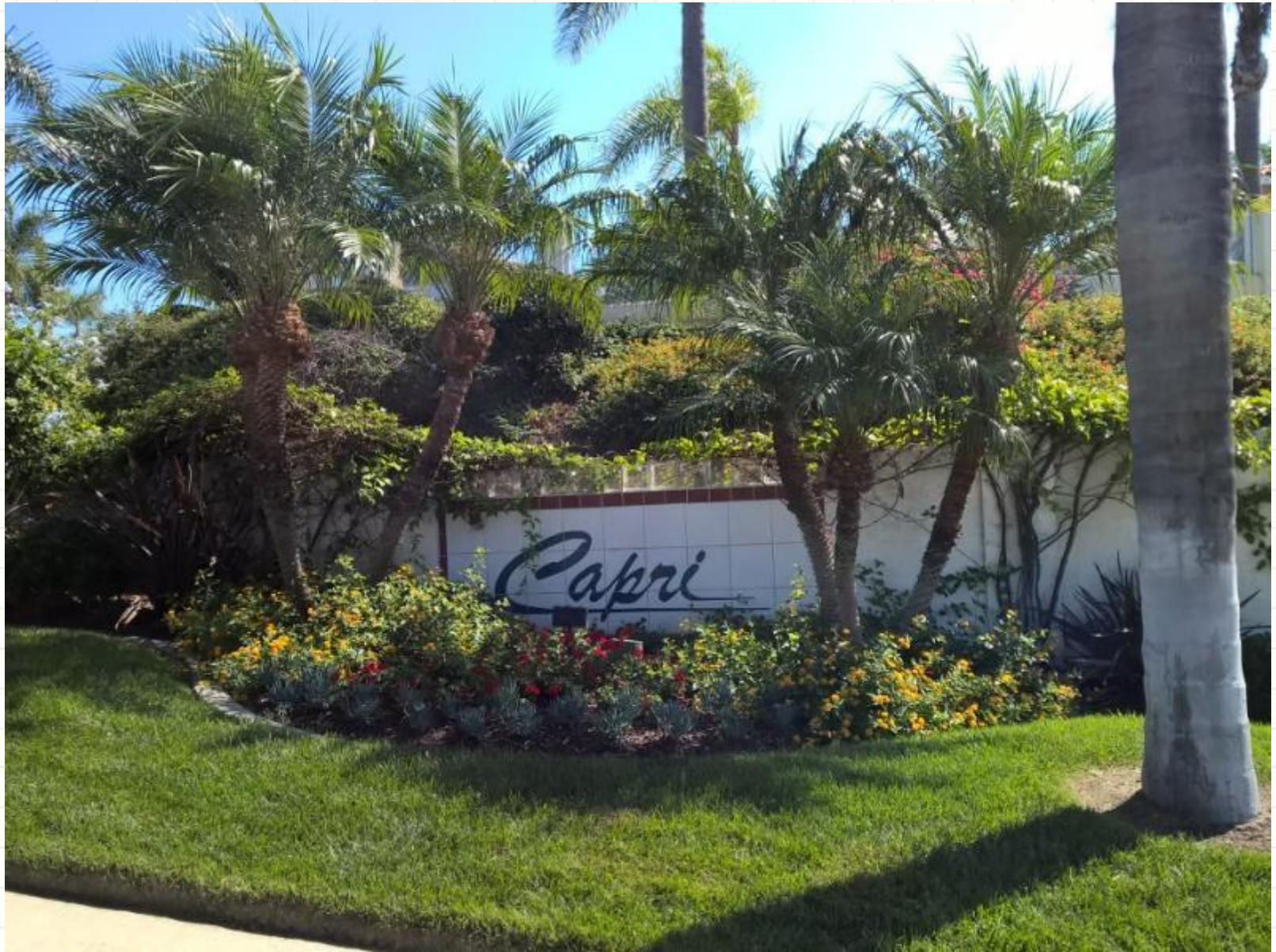
Replanted flowers at Capri Monuments