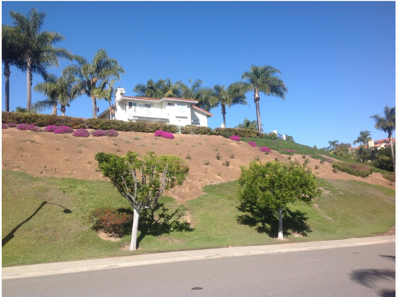
Landscaping along Horizon