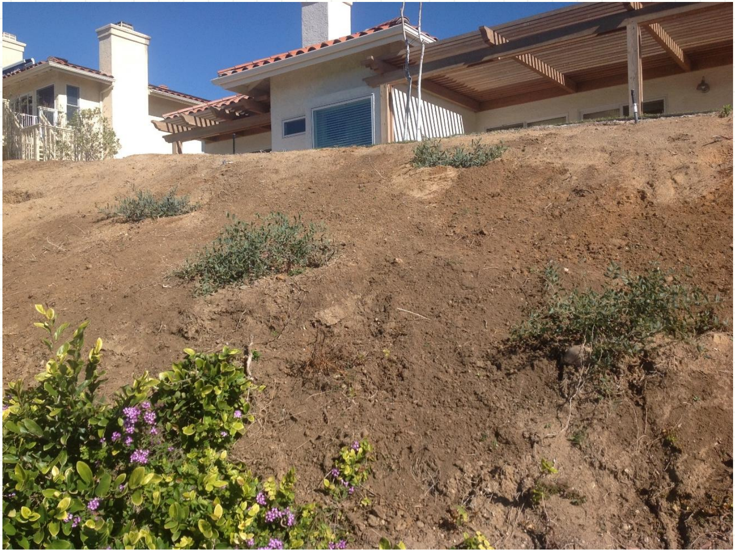
New planting along Toby's Trail.