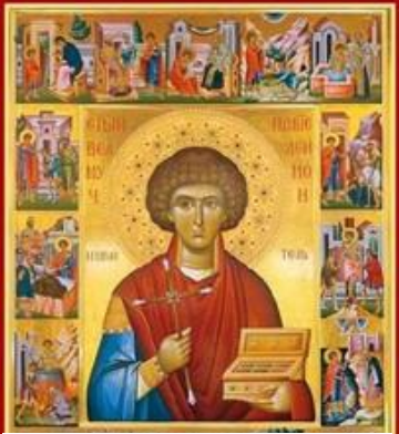
Gr. Martyr and Healer St. Panteleimon

PLEASE PRAY FOR HEALING, COMFORT, AND SPIRITUAL PEACE