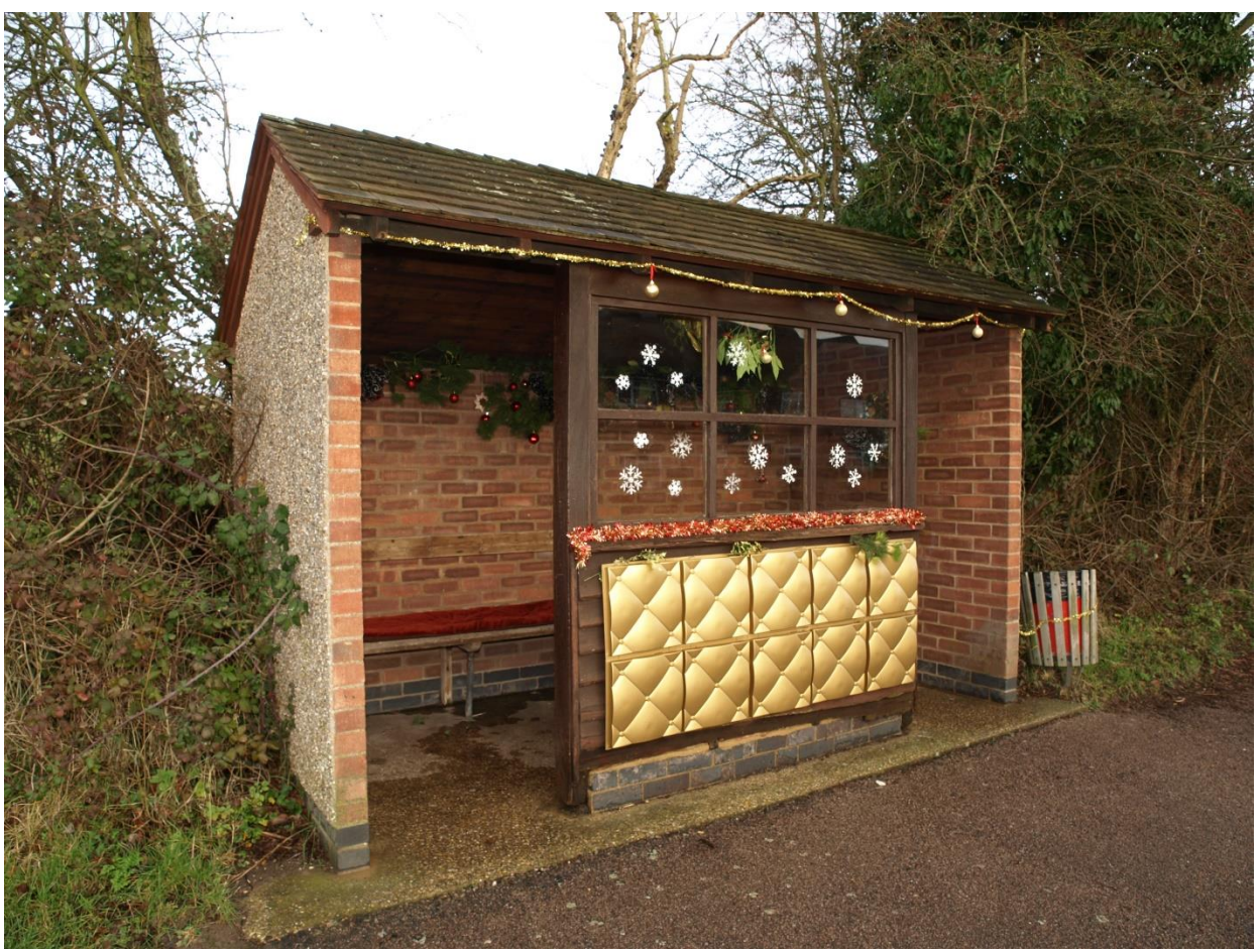
Christmas decorations 2012