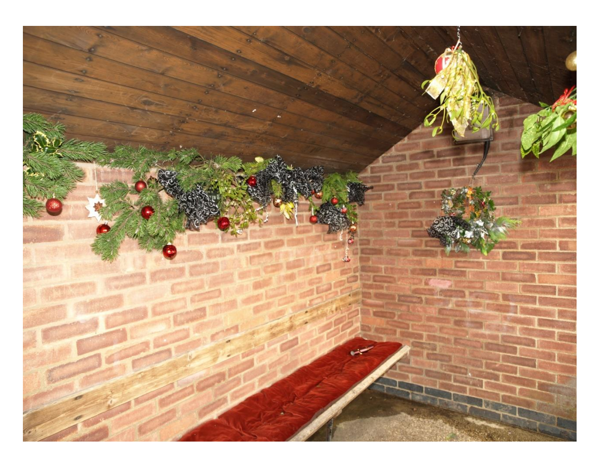
Christmas decorations 2012