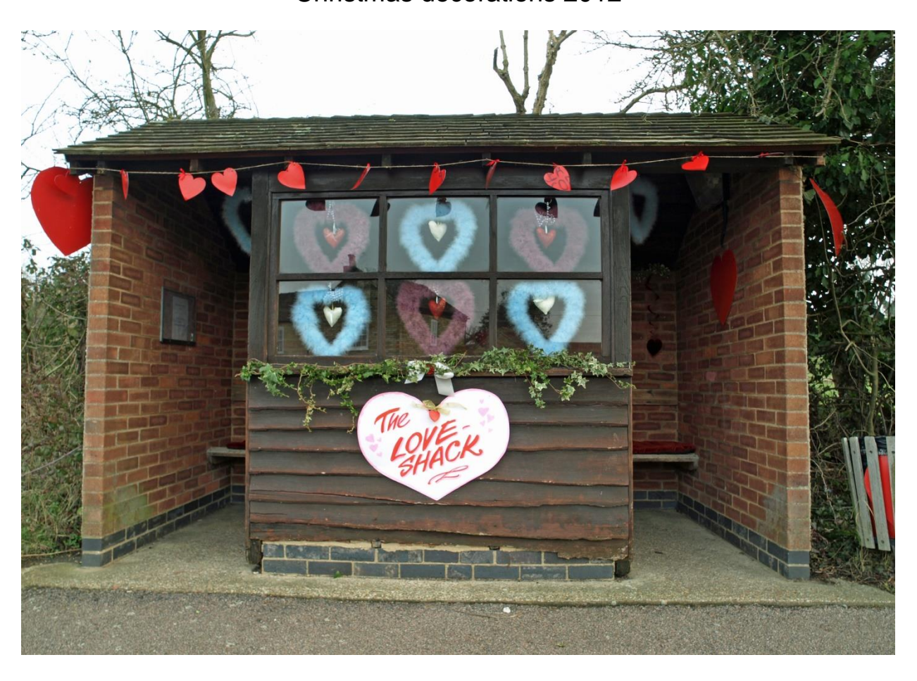
The Shelter decorated for St Valentine's Day 2013