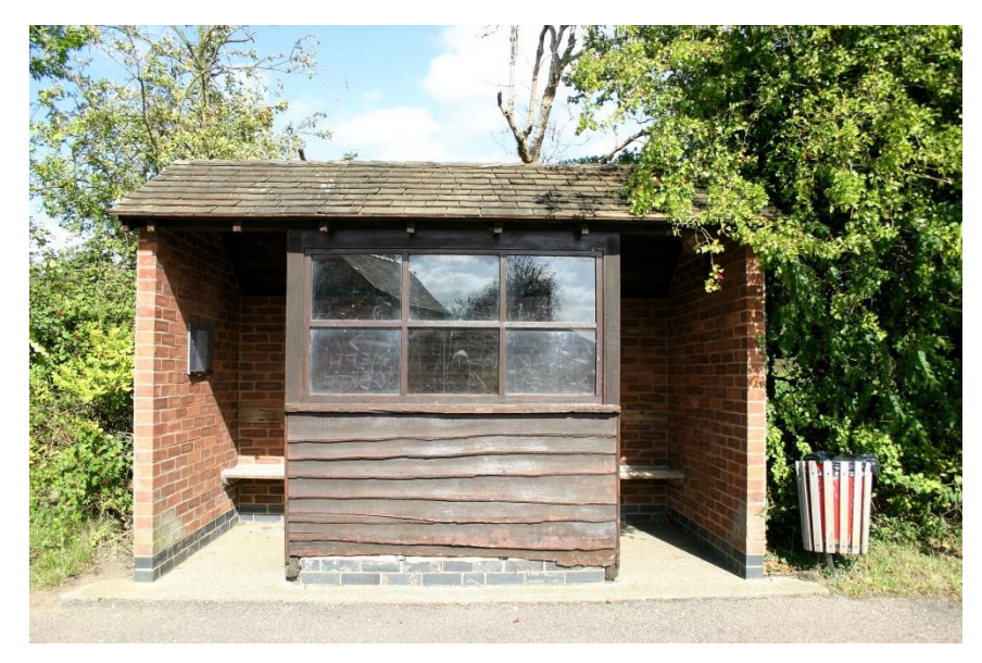
Toft Bus Shelter

In 1953 the local bus was still the most significant means of transport in Toft village, together with the bicycle. At a Parish meeting it was agreed that as a permanent commemoration of the Coronation of Queen Elizabeth II in that year, an English oak tree would be planted on the Green and a bus shelter erected. The brick Shelter, based on a design in use in Little Gransden was built by Messrs. Barford by the Glebe meadow for £106, paid for by the village and there was a grand celebration on January 24th 1954 when the Chairman of the County Council, Col. Parker, visited the village to inaugurate both the shelter and the tree. The Parish Council's decision also to make a permanent commemoration of the Coronation, in erecting a brick bus shelter and bench seat by the Glebe meadow, would have had more resonance then than in our age of widespread car ownership. Today's travellers still, nonetheless, enjoy the convenience of the shelter, at a time of re-established significance for public transport.