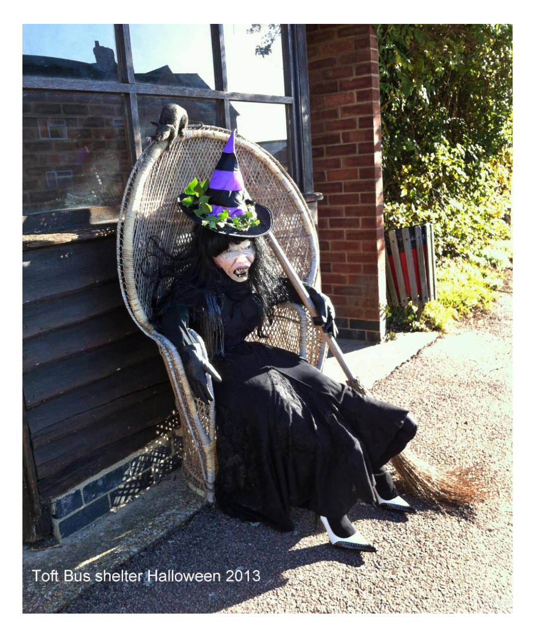
The Shelter decorated for Halloween 2013