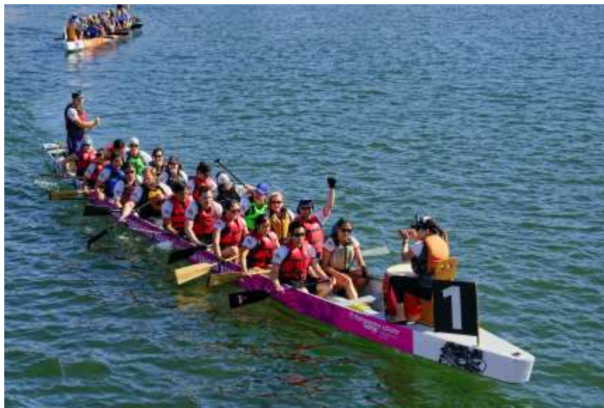
Your New 2019-2020 Board Members