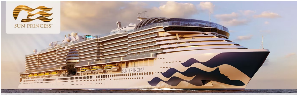
Inaugural Cruise: 2024 | Guest Cabins: 2,150 | Guest Capacity: 4,300 | Number of Decks: 21 | Tonnage: 175,500 | Length: 1,133 feet