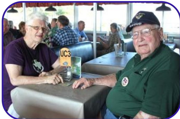
Belle of Hot Springs Dinner Cruise