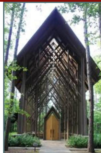
Anthony Chapel at Garvin Gardens