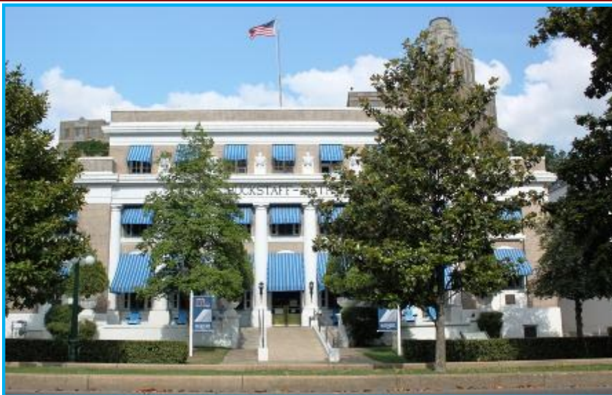
The Historic Buckstaff Bath House on Hot Spring's Bathhouse Row