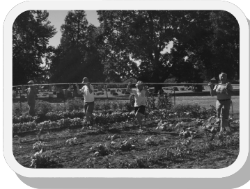
St. Paul Community Garden