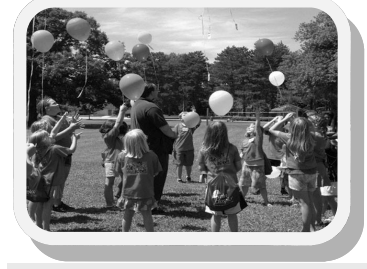
Camp Good Grief

This publication shares news about the Ottawa County Community Foundation as we fulfill our mission of creating philanthropy and making our community a better place to live, work and raise a family. The Ottawa County Community Foundation is a public charitable foundation affiliated with the Toledo Community Foundation.