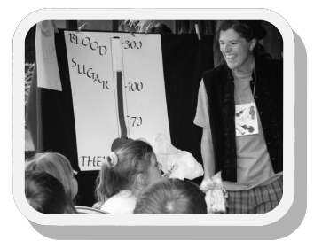
Diabetes Youth Camp