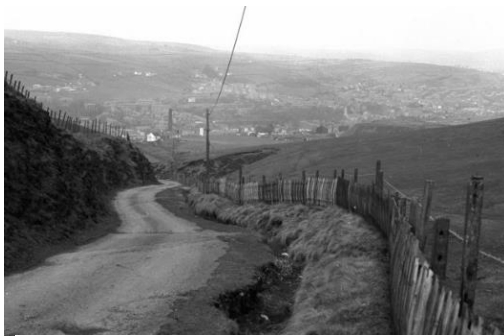
Rooley Moor Road