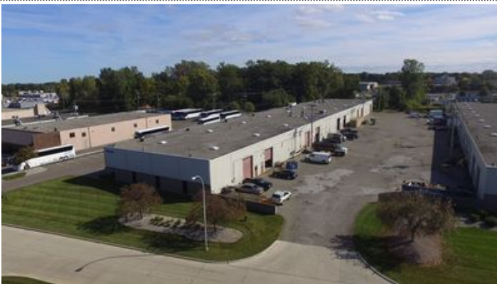
Universal Trade Center 1 (3)