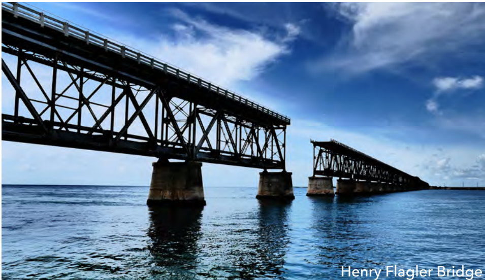
Henry Flagler Bridge