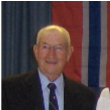
Everett – 40 th Anniversary of Fjellheim Sept, 2013