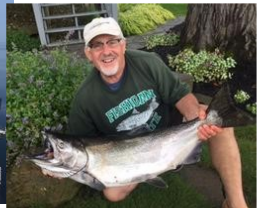
Dean's Dream - 27.6# King - 7/22/17