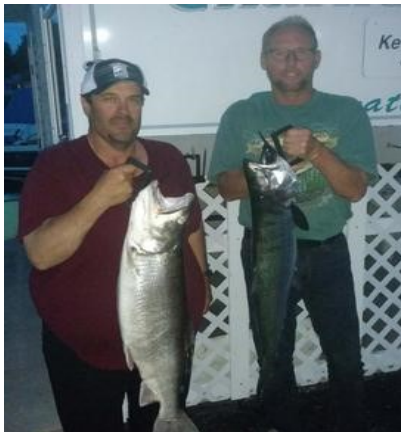
Full Draw - 15.6# Lake Trout - 7/11/17