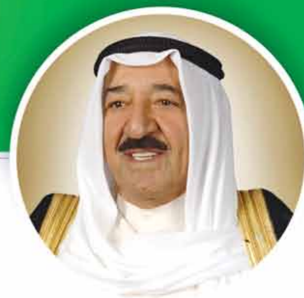
His Highness Sheikh Sabah Al-Ahmed Al-Jaber Al-Sabah The Amir Of The State Of Kuwait