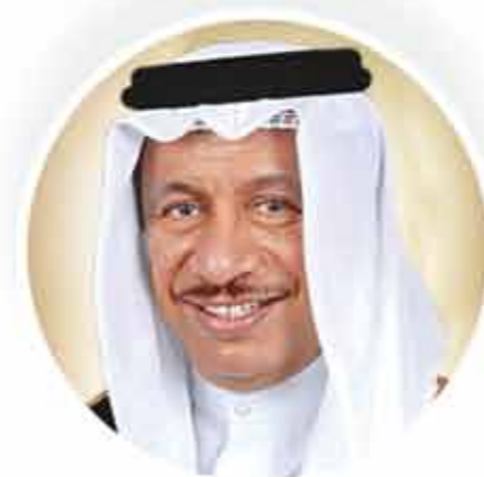
His Highness Sheikh Jaber Al-Mubarak Al-Hamad Al-Sabah The Prime Minister Of The State Of Kuwait