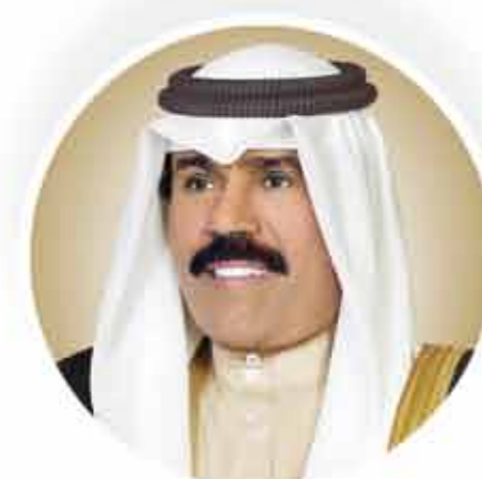
His Highness Sheikh Nawaf Al-Ahmed Al-Jaber Al-Sabah The Crown Prince Of The State Of Kuwait