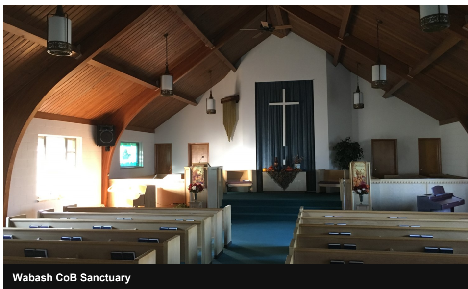
Wabash CoB Sanctuary

We welcome all who are on the journey to know Jesus, who share in his love and who choose to embrace the diversity within this community of believers. As individuals we may be at different places along the path, but as a community, we are all traveling together in faith, trusting God to show us the way.