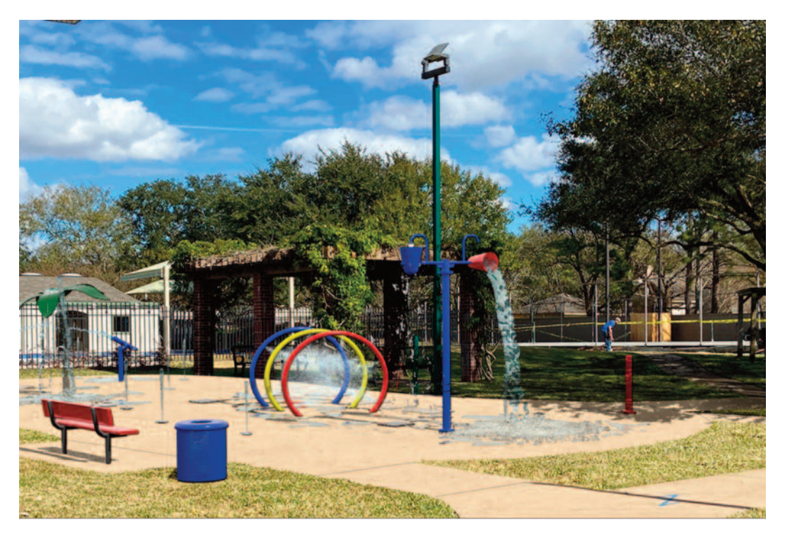
Here are some FAQs about the Splash Pad project: