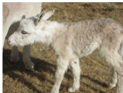
New Arrival at Luv Me Tender ...