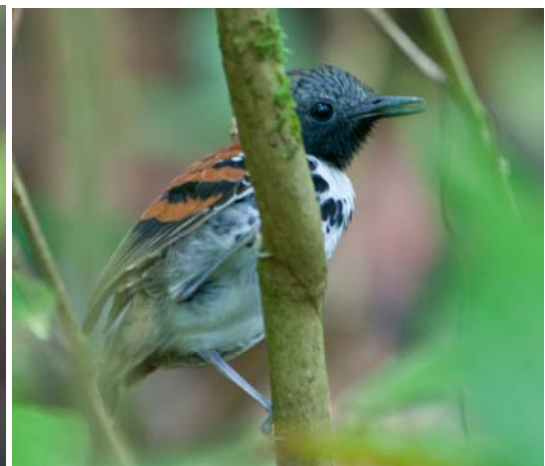
Bi-colored Antbird [Cerro Azul]; Spotted Antbird [PN Soberanía]