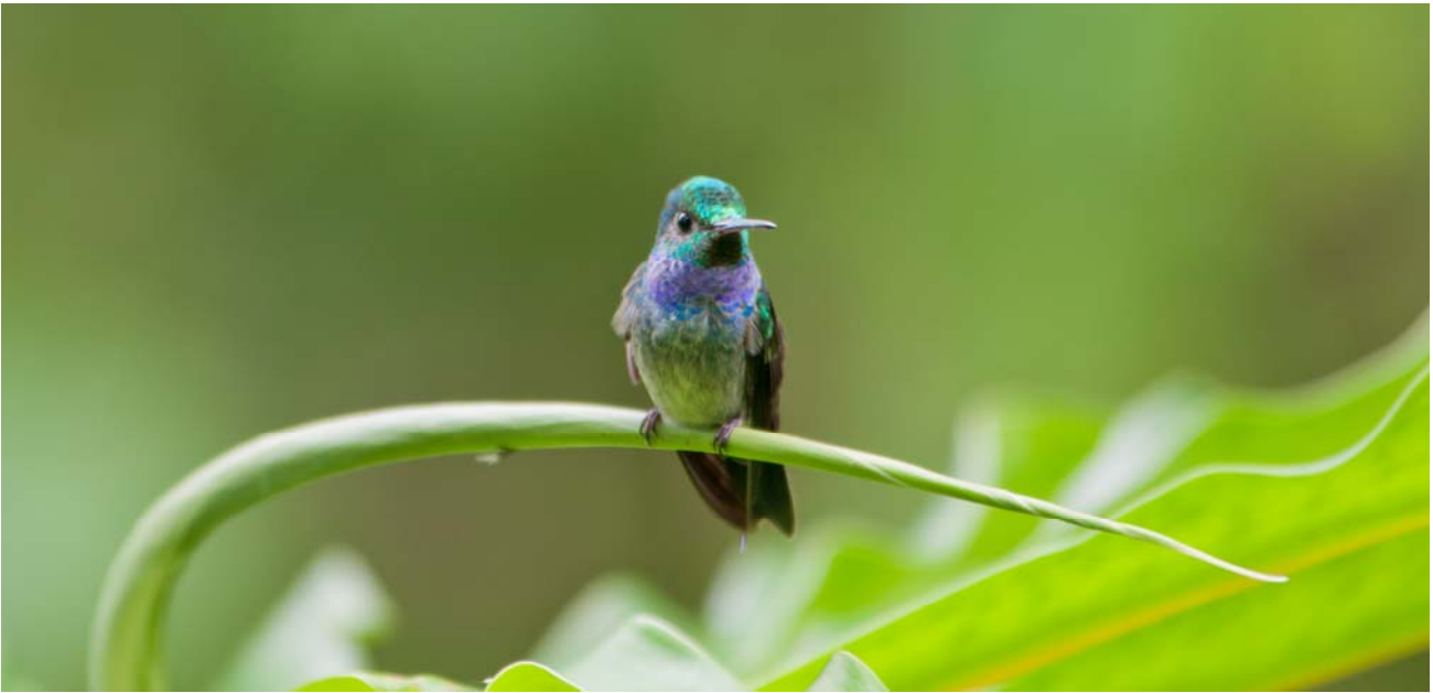
Blue-chested Hummingbird [PN Soberanía]