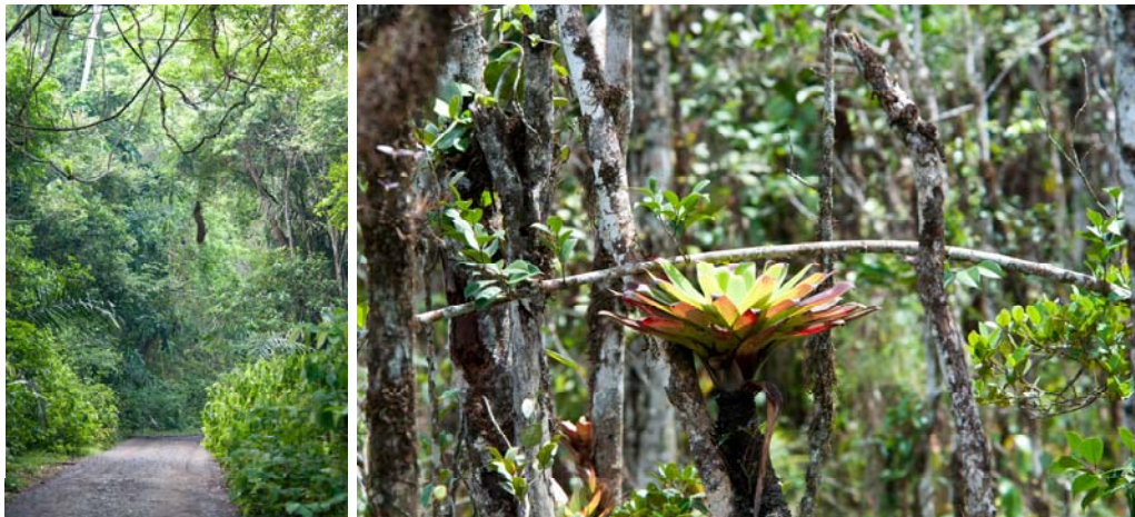
Pipeline Road through Parque Nacional Soberanía; Elfin Forest in Parque Nacional Chagres (Cerro Azul)