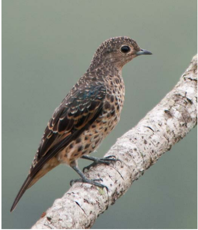
Long-billed Hermit; Blue Cotinga (female) [both PN Soberanía]