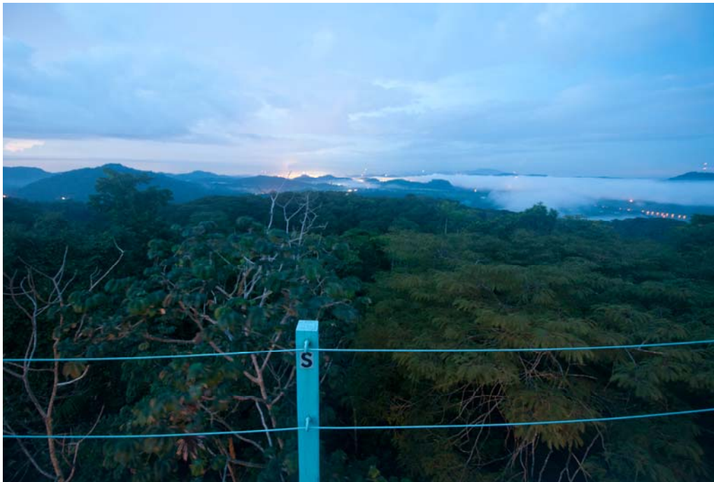
Dawn vista from the Canopy Tower roof towards Panama City and the Panama Canal

Kinkajou ( Potos flavus ) * [CT]: A single, late-evening visitor feeding on the cecropia next to the Canopy Tower.