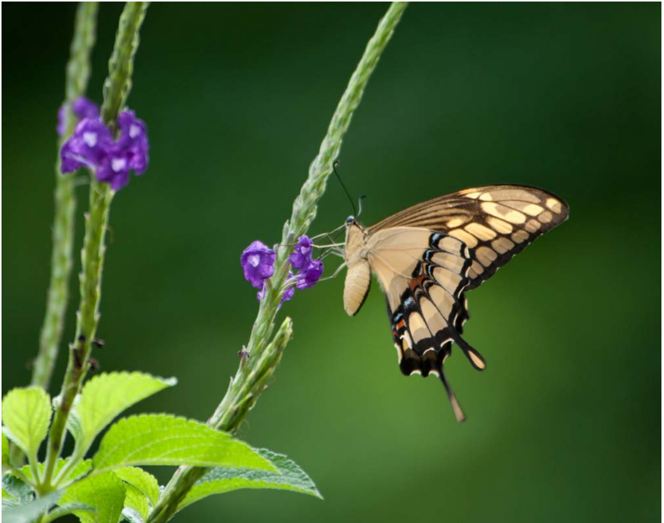
A presumed Thoas Swallowtail (Heraclides thoas) [PN Soberanía]