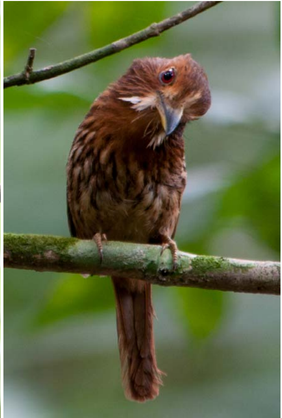
Black-throated Trogon (female); White-whiskered Puffbird [both PN Soberanía]