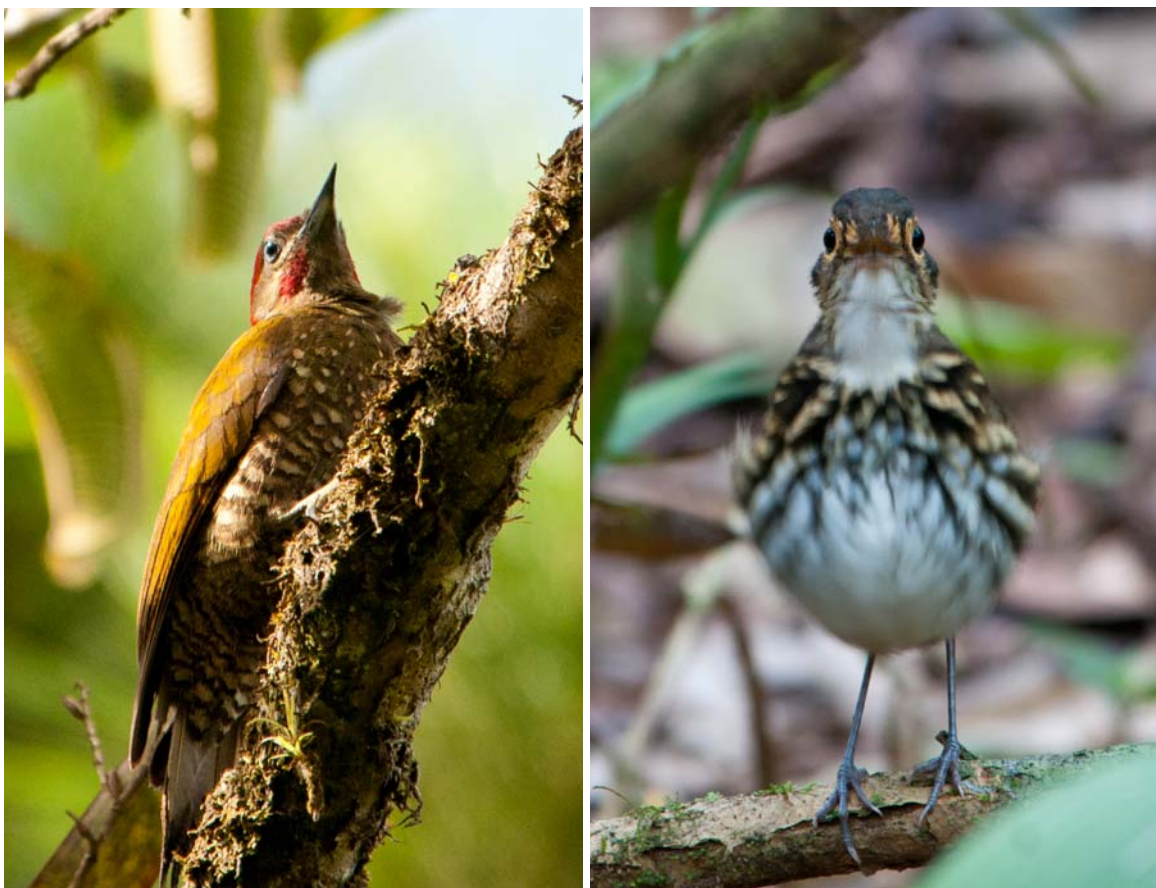
Stripe-cheeked Woodpecker [Cerro Azul]; Streak-chested Antpitta calling from its low perch [PN Soberanía]

A converted radar tower perched on the highest hill within the park, the Canopy Tower ( www.canopytower.com ) is a unique birding location providing 360° eye-level views of the surrounding canopy, plus distant glimpses of the Panama Canal and the high-rise skyline of Panama City. In addition to dawn and dusk birding from the roof, four days were sufficient to sample some of the best Canal Zone birding sites, including two days along the renowned Pipeline Road that bisects the mostly secondary lowland forest in the Parque Nacional Soberanía; a morning at the Parque Natural Metropolitana in Panama City; and a full day searching for foothill species at Cerro Azul. I relied exclusively on transportation provided by the Canopy Tower and was guided each day by the excellent Alexis. Low season tourist numbers resulted in pleasantly small group sizes and although we did experience a couple of the heavy rainstorms typical of the 'green' (rainy) season whilst out on the trails, these only briefly interrupted our birding.