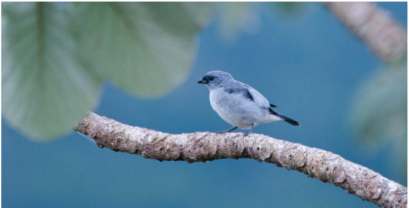
Plain-colored Tanager [PN Soberanía]