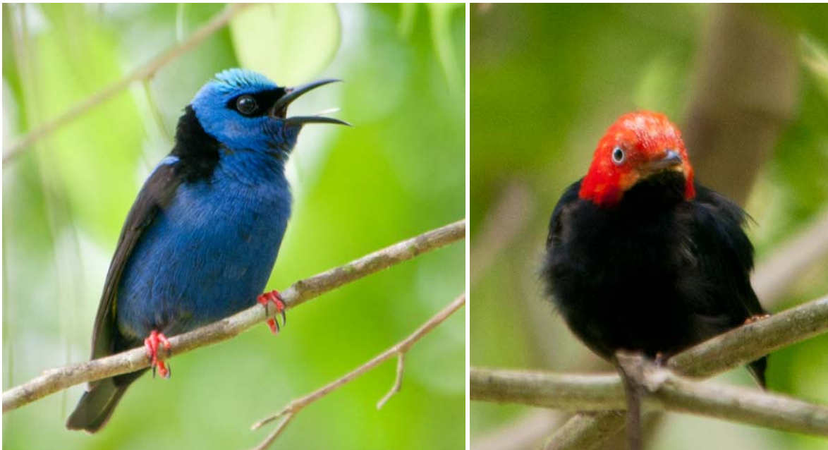
Red-legged Honeycreeper [Cerro Azul]; Red-capped Manakin [PN Soberanía]