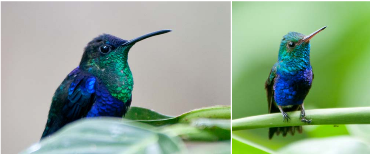
Violet-crowned Woodnymph [Cerro Azul]; Violet-bellied Hummingbird [PN Soberanía]