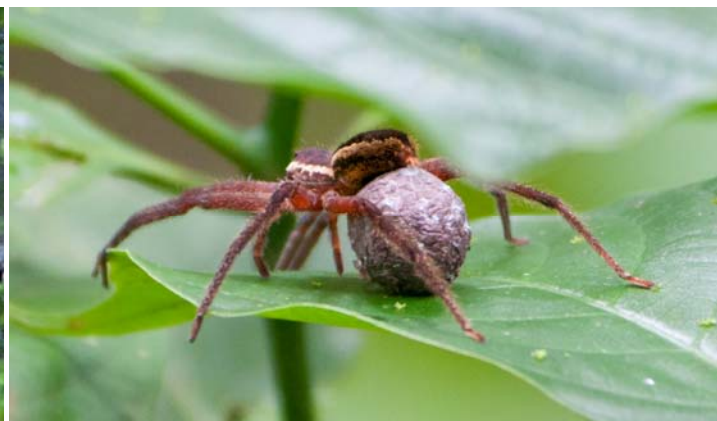
Army ants carrying larvae to new bivouac [PN Soberanía]; Spider and eggs hiding from army ant swarm [Cerro Azul]