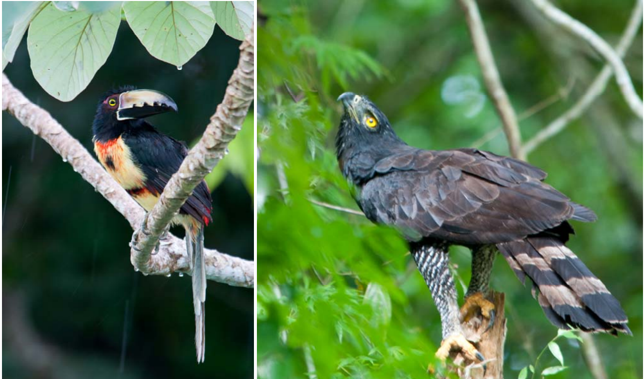
Collared Araçari; Black Hawk-Eagle [both PN Soberanía]