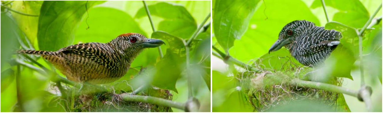
Fasciated Antshrikes (female and male building a nest) [PN Soberanía]