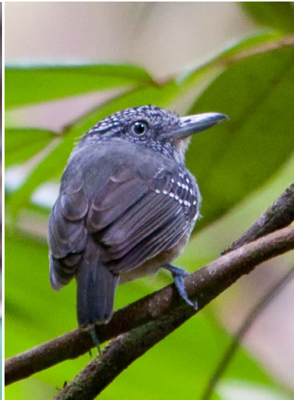
Streak-chested Antpitta; Spot-crowned Antwren [both PN Soberanía]