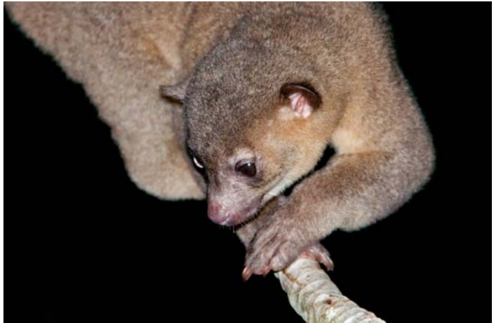
Geoffroy's Tamarin; Kinkajou [both PN Soberanía]