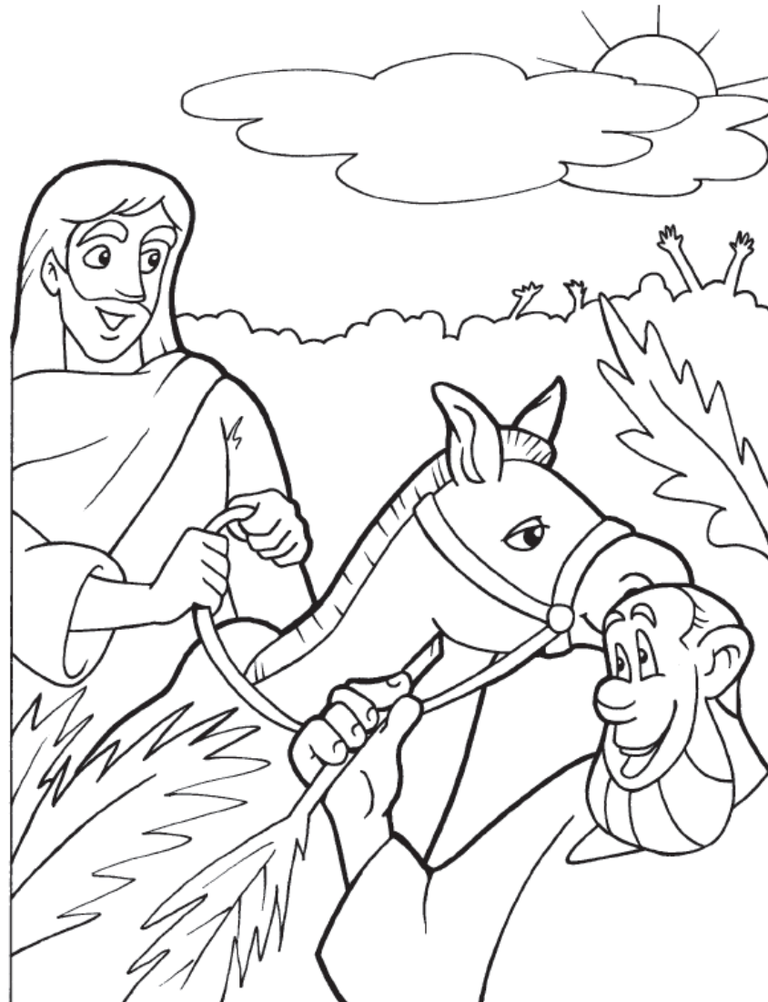
The Triumphal Entry