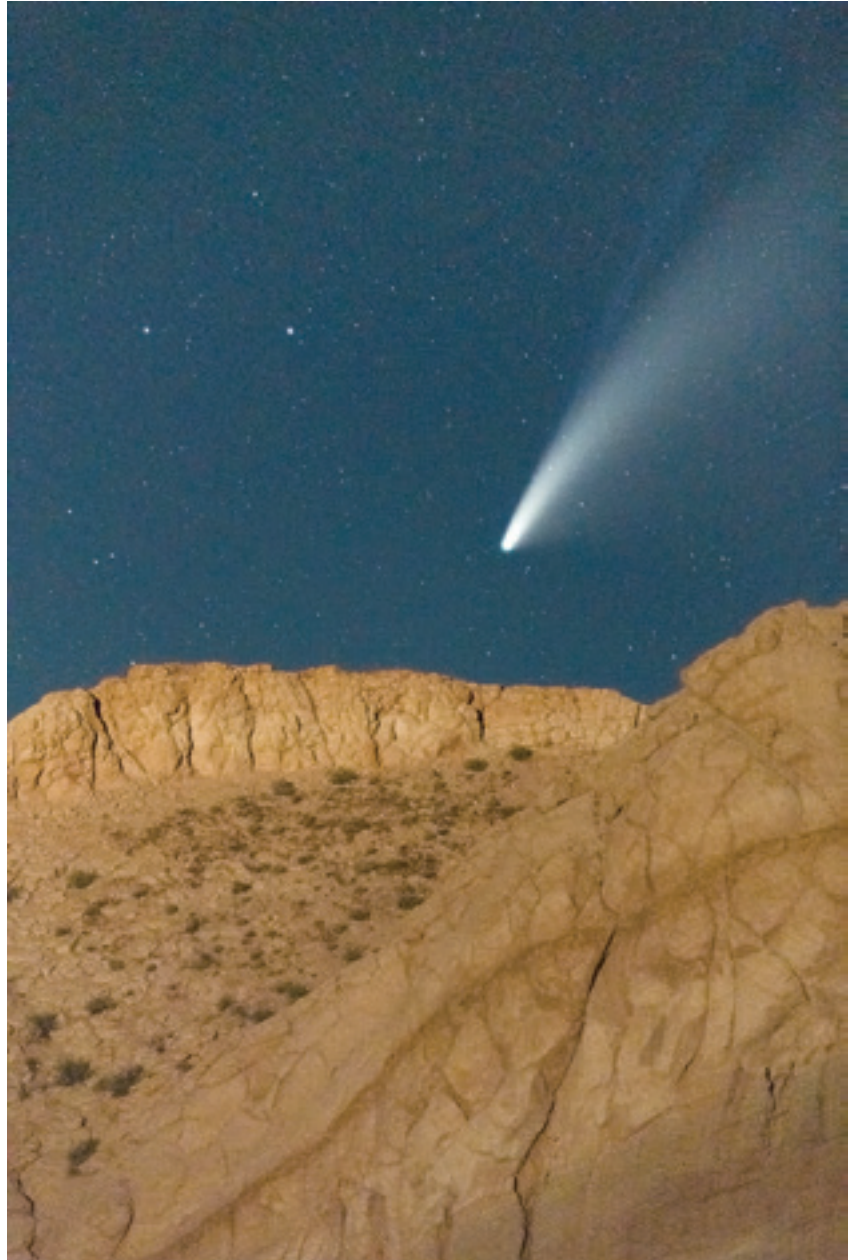
NEOWISE at Red Rock

Our local camera club took a trip to Devil's Punchbowl County Park, which overlooks the Antelope Valley, where we live. Another evening we traveled to Saddleback Butte State Park to feature the local Joshua trees in our comet shots. We returned to Red Rock Canyon twice more. Since we live in a desert area, there was not a cloud in the sky, so perfect viewing conditions for NEOWISE.