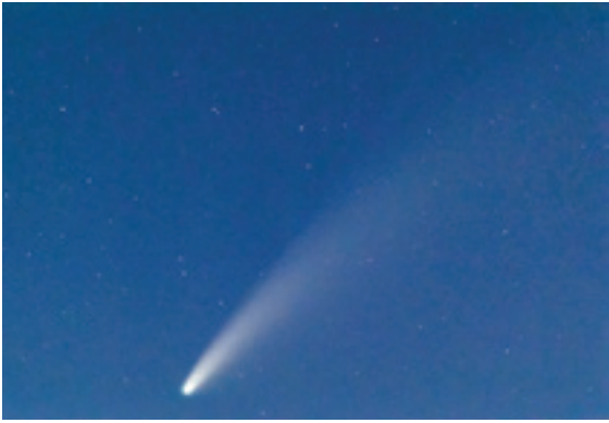
NEOWISE up close

could go in the local area to find a more compelling foreground. Over the next eight days we went out five times chasing the perfect shot. The first few days the comet was bright enough to see with the naked eye even inside the city. By the last day (July 24) it was faint enough to be seen only with binoculars even in a place dark enough to see the Milky Way.