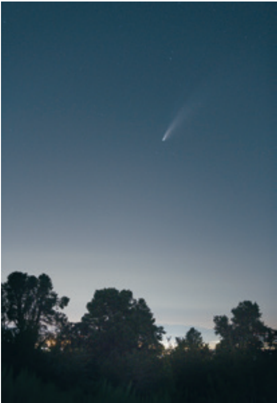
NEOWISE at the Punchbowl