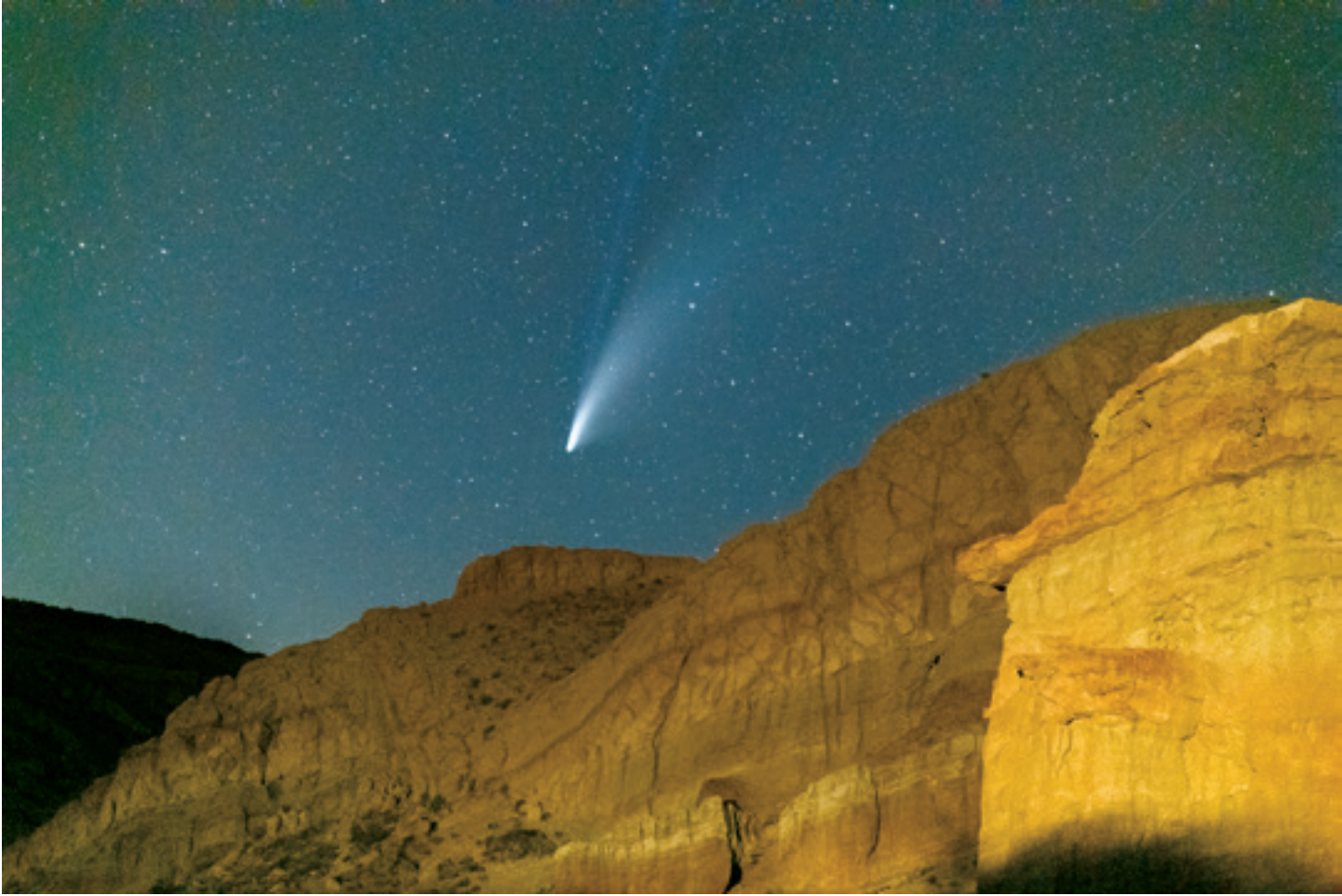
NEOWISE Split Tail