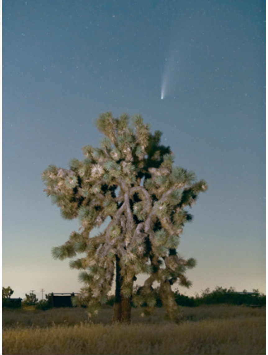
Joshua Tree and NEOWISE

Any mention of products or services in this article or anywhere else in the PSA Journal does not constitute an endorsement or approval of those items.