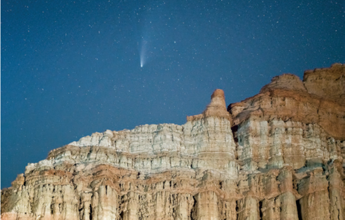
Red Cliffs and NEOWISE