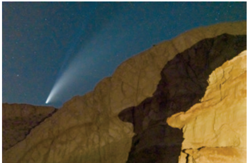
Comet with Silhouette