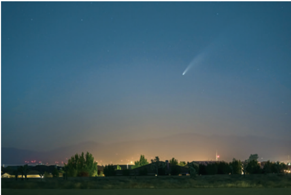
NEOWISE Over the City