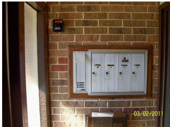
Knox Box at common entry to condominium

Knox-Box model # 3207, non hinged door (see brochure)