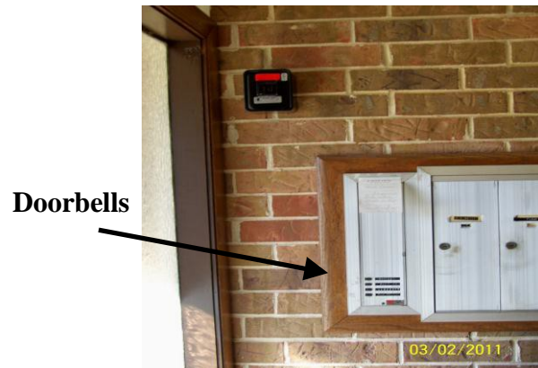
Mounted at approx. eye level