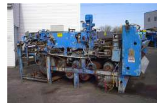
Well-used belt filter ready to be brought back to life by TriStar

Reusing major components such as the frame, rollers, and drives saves on delivery time and materials costs.