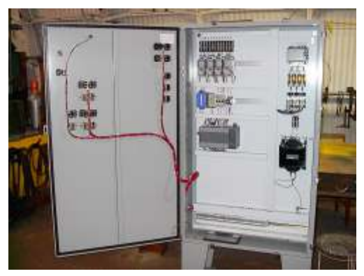
New control panel replaces obsolete controls.

Control Panels and Wiring - TriStar makes our own panels to replace damaged or obsolete OEM panels.