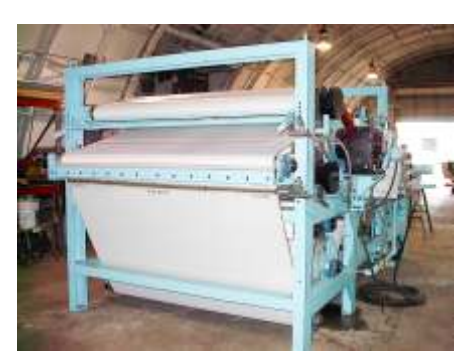
Fully restored belt press for municipal sludge dewatering features newly painted frame, new TriStar belt, and all new controls.