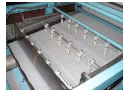
Rebuilt plow section and TriStar Filter Belt

Parts and Service – We provide most belt filter parts including bearings, belts, steering differential valves, pneumatic steering actuators, rubber & plastic seals, and rubber drive rollers (recoated). On-site service by a factory technician is available.