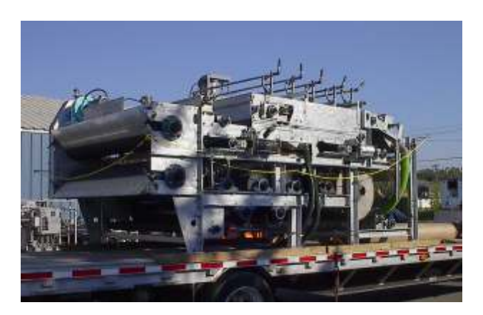
Remanufactured belt filter by TriStar LTD. Completely rebuilt including sand-blasted & galvanized frame, resurfaced rollers, new bearings, new steering controls, and conversion from pneumatic to hydraulic control.

TriStar Ltd will rebuild your existing Belt Filter to like-new condition or remanufacture a used unit to your specifications. We have 18 years of experience in remanufacturing with dozens of installations worldwide.