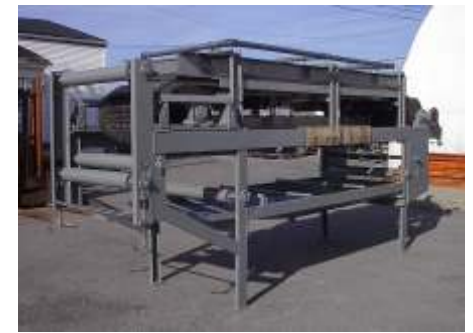
Remanufactured vacuum belt filter with all new components and a special, epoxy coated frame.