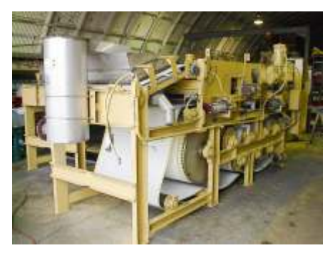
Remanufactured three-belt design belt filter with new TriStar belt. Frame was completely stripped, treated, and electrostatically painted.