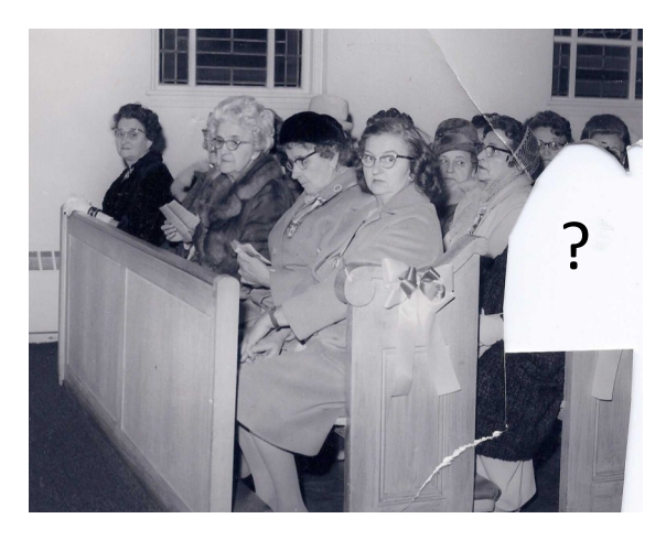
1-12-2 How many ladies can you identify in the front row; in the second row? Who was cut out of the photo...why? What was the occasion?

We have decided to publish a St. Casimir's Parish Cookbook filled to the brim with the best recipes from the best cooks in our community and we need your favorite recipes! You may submit as many or as few recipes as you wish. We will select the recipes to be included in the cookbook and your name will be printed with each of your own recipes! These attractive 5.5" x 8.5" cookbooks will most definitely become a cherished keepsake on your kitchen shelf!