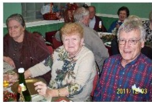
Friends of St.Casimir's