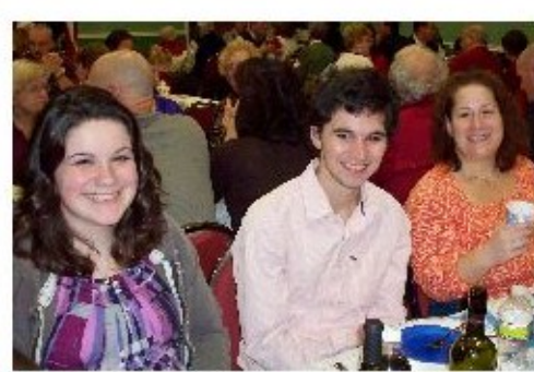
Friends of St.Casimir's